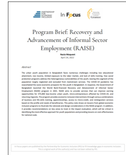
Program Brief: Recovery and Advancement of Informal Sector Employment (RAISE)