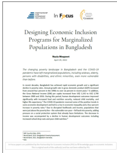
Designing Economic Inclusion Programs for Marginalized Populations in Bangladesh

This PEI In Practice is supplemented by three resources, as part of the In Focus Series, which includes deeper, more focused explorations into operational learning, target populations, inclusive programming, and more.