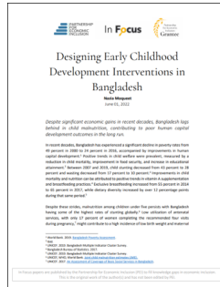
Designing Early Childhood Development Interventions in Bangladesh