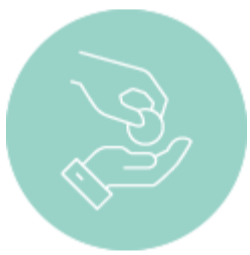
WAGE EMPLOYMENT FACILITATION