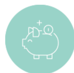
FINANCIAL SERVICES FACILITATION