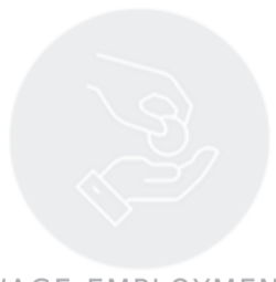
WAGE EMPLOYMENT FACILITATION