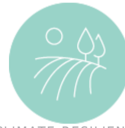
CLIMATE RESILIENCE SUPPORT