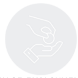
WAGE EMPLOYMENT FACILITATION