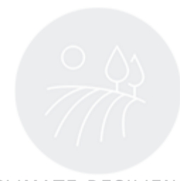
CLIMATE RESILIENCE SUPPORT