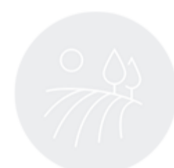
CLIMATE RESILIENCE SUPPORT