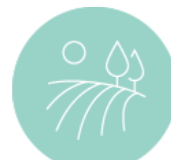
CLIMATE RESILIENCE SUPPORT