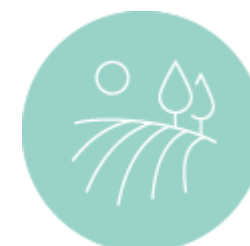
CLIMATE RESILIENCE SUPPORT